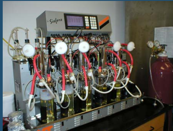
Benchtop fermentation producing Pasteuria endospores