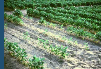
Soybeans dying due to cyst nematode damage