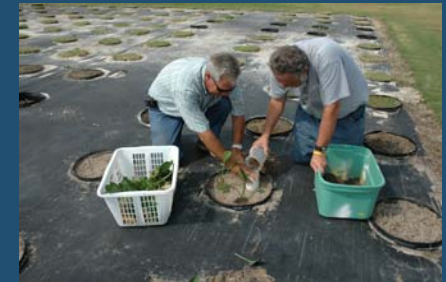
Plot trial for control of root-knot nematode on ornamental plants (hostas)