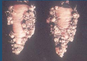
Carrots infested with root-knot nematodes

We have conducted tests of Pasteuria endospores produced in-vitro for nematode control activity and have found them to be as effective or better than in-vivo endospores in these experiments. In addition, we can produce endospores of Pasteuria isolated from Sting nematode, and have demonstrated growth of Pasteuria from Cyst, Lance and Lesion nematodes in tissue culture plates. Products controlling this group of nematodes will allow us to become an integral part of pest management strategies in a wide variety of crops, including turf, tomato, strawberry, vegetables, peanut, soybean and sugar beet.