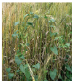
Figure 3. Wild buckwheat can be a problem in wheat. Note how the weed climbs the crop plant.