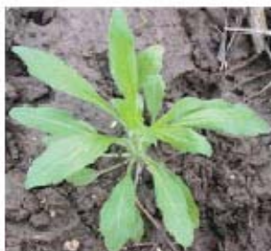
Figure 2. This photo shows a horseweed seedling in rosette stage, just beginning to bolt.

Horseweed (see Figure 2) is often misidentified as whitlowgrass, mouseear chickweed, corn or Persian speedwell, shepherd's-purse, or several of the fleabane species, especially annual fleabane (see Figure 3). The two most common misidentifications are whitlowgrass and fleabane species. Whitlowgrass has shorter