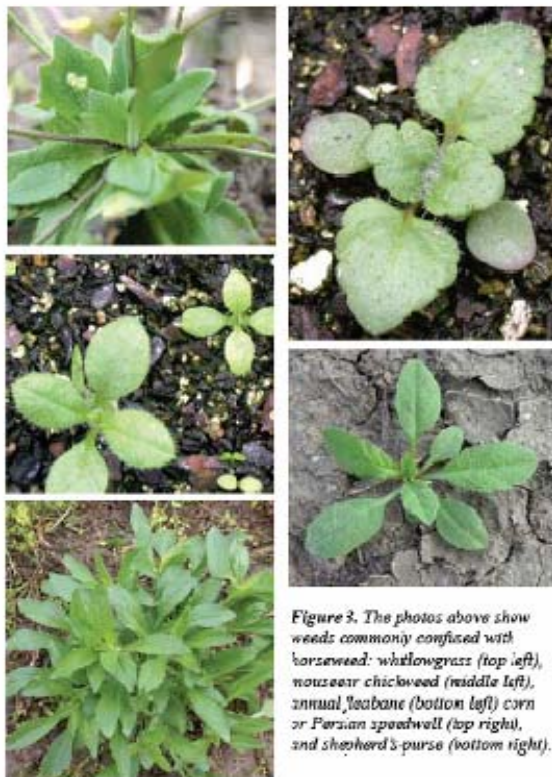
Figure 3. The photos above show weeds commonly confused with horseweed: whitlowgrass (top left), mouseear chickweed (middle left), annual fleabane (bottom left), corn or Persian speedwell (top right), and shepherd's-purse (bottom right).

and narrower leaves than horseweed, and a smooth to very slightly notched margin. Around the leaf margin, annual fleabane tends to have purple spots at the tip of each tooth while horseweed does not have these spots. Also, the distance between nodes on all fleabane species after bolting are greater than the internode distance on horseweed. Fleabanes will produce more branches than horseweed at the base of the plant. Mouseear chickweed, and corn and Persian speedwell have opposite leaves at all early stage nodes, and can easily be separated from horseweed, which has alternating leaves at all nodes. The first node of shepherd's-purse tends to have opposite leaves while subsequent nodes have alternate leaves, although leaves at all nodes may be alternating. The hairs on shepherd's-purse leaves are shorter and tend to stay on the upper leaf surface compared to horseweed leaf hairs, which are larger and usually present on leaf margins. In later development stages, shepherd's-purse leaves will be deeply lobed compared to the toothed or slightly lobed leaves of horseweed.