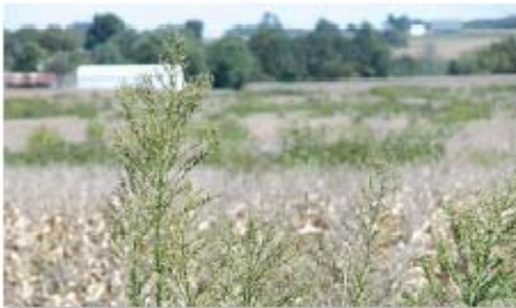
Figure 7. Horseweed plants protruding through soybean canopy in late summer.

Controlling horseweed in the seedling or rosette stage can be extremely effective since small plants are easily controlled and residual herbicide applied at these stages can provide control through early June. Emerged plants should be adequately controlled by 2,4-D ester (1 lb. ai/A). When the 2,4-D rate is limited to 0.5 lb. ai/A, combine with glyphosate, Sencor ® ,