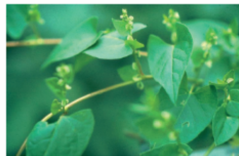
Figure 5. Wild buckwheat produces flowers in short-stemmed clusters in the axils of the leaves or at the end of stems. Flowers are small and have no petals, but have five greenish or pinkish sepals.

Wild buckwheat is a member of the smartweed family. Like other smartweeds, wild buckwheat possesses an ocrea (thin membrane) around the stem at each node. It can be confused with field bindweed because of its vining growth habit and arrowhead-shaped leaves. Field bindweed, however, is a perennial, has an extensive underground root system, does not possess an ocrea, and has large funnel-shaped flowers that are white or pink. Also, wild buckwheat's lower leaves are usually much wider than bindweed leaves.