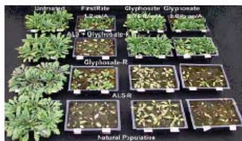
Figure 6. One horseweed population showing resistance ALS and glyphosate herbicides (top row), resistance to glyphosate herbicides only (second row from top), resistance to ALS herbicides only (third row from top), and no herbicide resistance (bottom row).