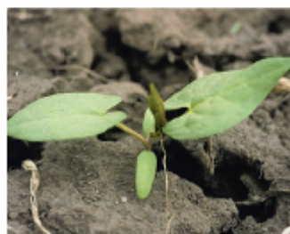
Figure 4. Note the narrow cotyledons and rounded base on this wild buckwheat seedling. The weed's leaves are alternate, heart- or arrowhead-shaped, and pointed at the tips.