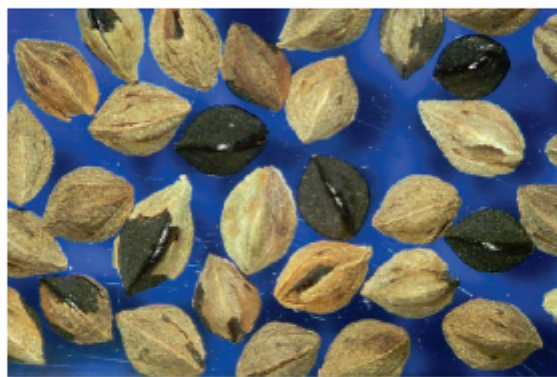
Figure 2. Wild buckwheat grows from hard, black, triangular seeds about 1/8 inch long.

Wild buckwheat is a summer annual that grows from a hard, black, triangular seed about 1/8 inch long (see Figure 2). The cotyledon is narrow with a rounded tip and base. The plant has long, slender, creeping stems that trail along the ground or climb any plants or objects they contact (see Figures 1 and 3). The leaves are alternate, heart- or arrowhead-shaped, pointed at the tip, and have widely separated lobes at the base (see Figure 4). Plants bloom throughout the summer and the flowers are small and have no petals, but have five greenish or pinkish sepals. Flowers are located in short-stemmed clusters in the axils of the leaves or at the end of stems (see Figure 5).