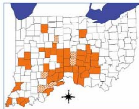
Figure 5. Glyphosate-resistant horseweed has been identified in at least one field in the counties marked with solid orange. A few fields contain horseweed populations resistant to glyphosate and either chlorimuron or laransulam — these counties are indicated with the cross-hatch pattern.

In Indiana, horseweed populations resistant to glyphosate and FirstRate® have been found in Bartholomew, Jefferson, Scott, and Washington counties; populations resistant to glyphosate and Classic® have been found in Bartholomew, Scott, and Wells counties; and populations resistant to glyphosate, FirstRate®, and Classic® have been found in Bartholomew and Scott counties.