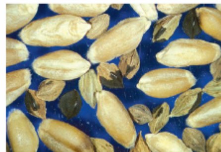
Figure 6. Wild buckwheat seeds are one of the most common contaminants in all seed stock. This photo shows black, triangular wild buckwheat seeds mixed with wheat seeds. The two seeds are similar in diameter.

Wild buckwheat is native to Europe and has become widely distributed in temperate regions via grain transport. Wild buckwheat also is one of the most common contaminants in all seed stock. Its seed is similar in diameter to wheat seed and is often planted with the grain (see Figure 6). At harvest, many seeds do not thresh completely from the seed coat and are especially difficult to clean from wheat. Wild buckwheat grows