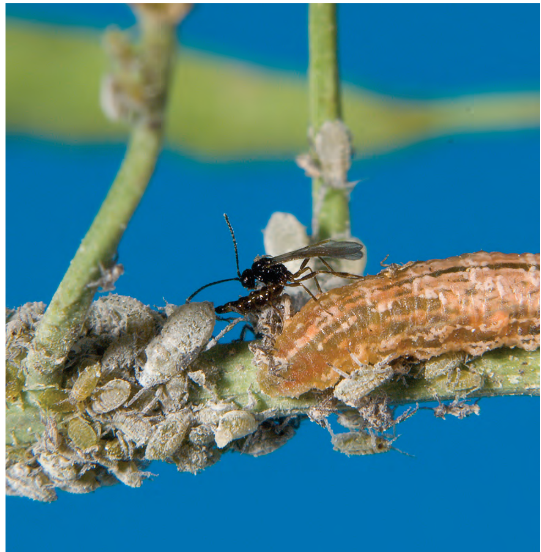
Female Aphidius standing on a hoverfly larva injecting an egg into an aphid.

This poster reports on a project initiated by a group of enthusiastic arable farmers who wanted to see a robust comparison between conventional pest and disease management and an IPM approach.