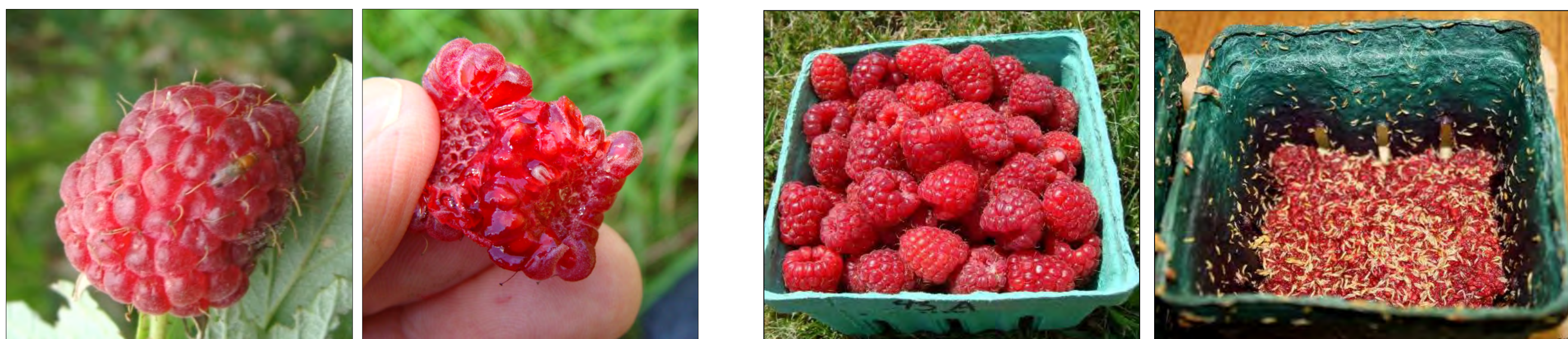
Left: spotted wing drosophila adult ♂ Right: spotted wing drosophila larvae