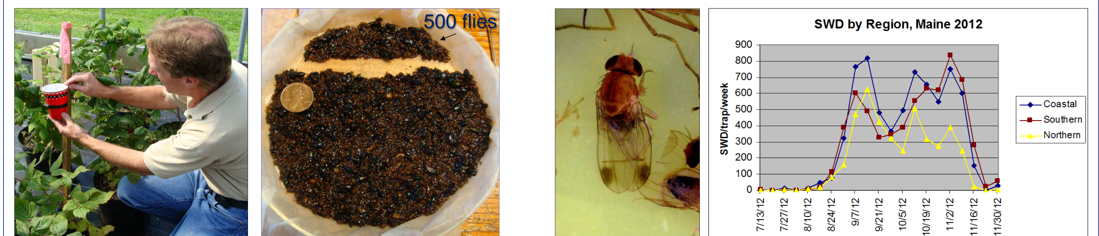
Left: spotted wing drosophila trap monitoring