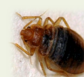
Figure 2. People currently with bed bugs reported the following quality of life impacts: