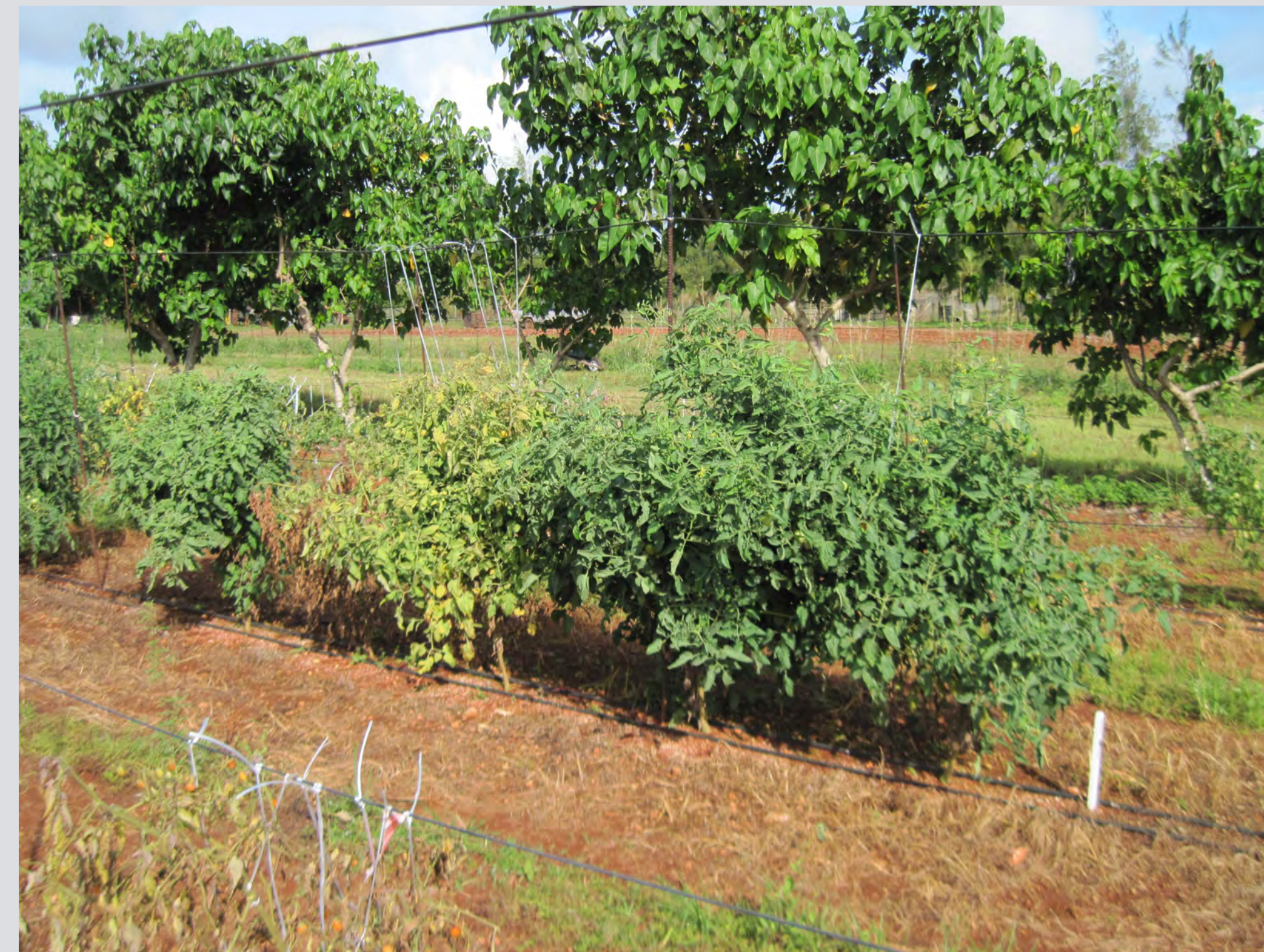
Figure 2: An AYVV infected tomato plant (scale 4), compared to a healthy tomato plant (scale 0).