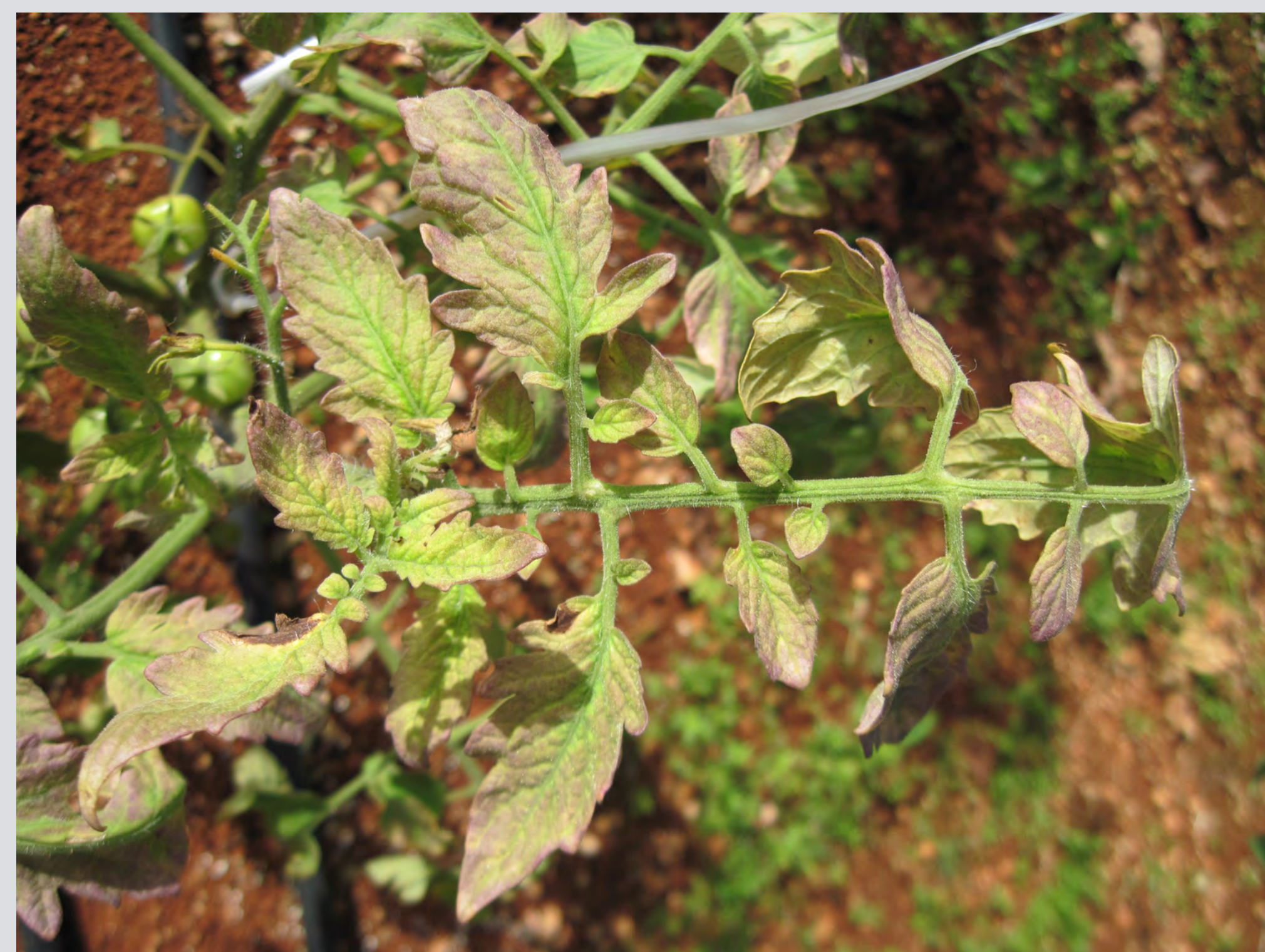
Figure 4: A close-up of a tomato leaf with AYVV symptoms, identified as scale 5.