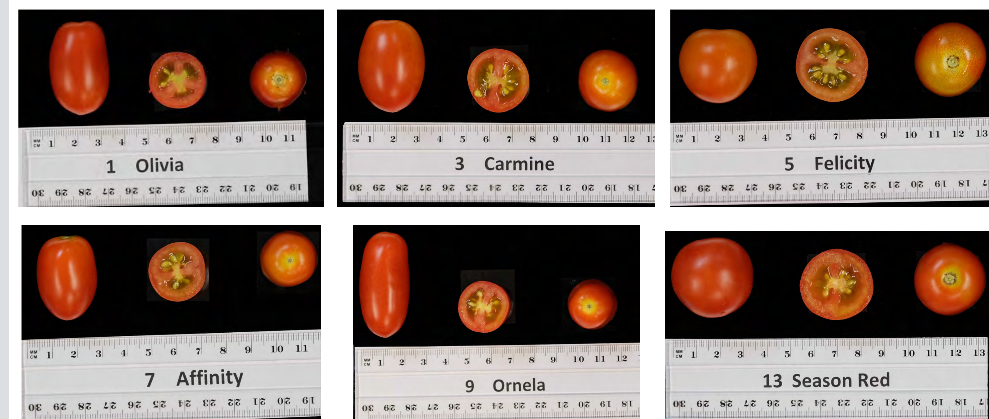
Figure 5: Varieties selected by producers for suitability on Guam during wet-season, compared to ' Season Red '.

*Samples confirmed to have AYVV based on Real-time PCR analysis.