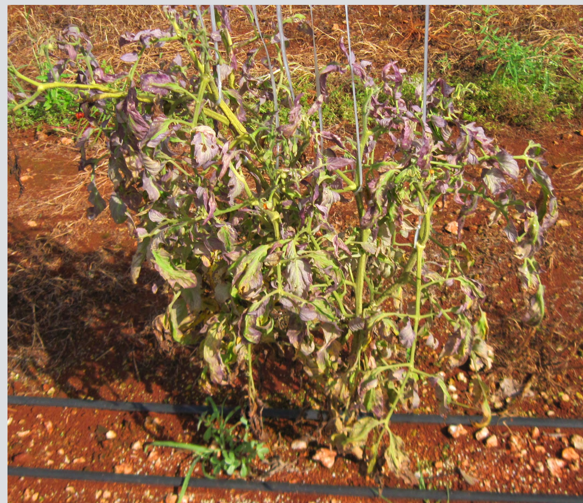
Figure 3: Tomato plant with severe AYVV symptoms, identified as scale 5.